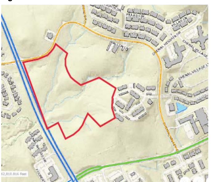
Figure 3. Master Street Plan

The site is immediately adjacent to Chenal Parkway, designated as a Principal Arterial. The primary function of a Principal Arterial is to serve through traffic and to connect major traffic generators or activity centers within an urbanized area. Lower design standards are required for Principal Arterials compared to Expressways. Since these roads are designed for through traffic and are generally located three or more miles apart, dedication of additional right-of-way is required to allow for future expansion to six through lanes plus left and right turn lanes.